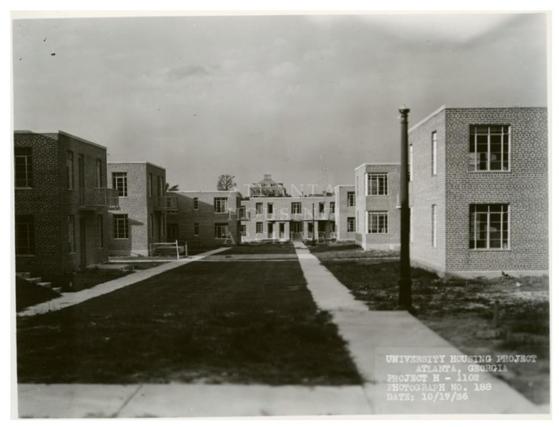
University Homes two-story apartment type under construction, Atlanta, GA, 1936.