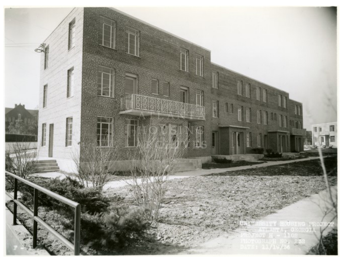
University Homes two-story apartment type under construction, Atlanta, GA, 1936.