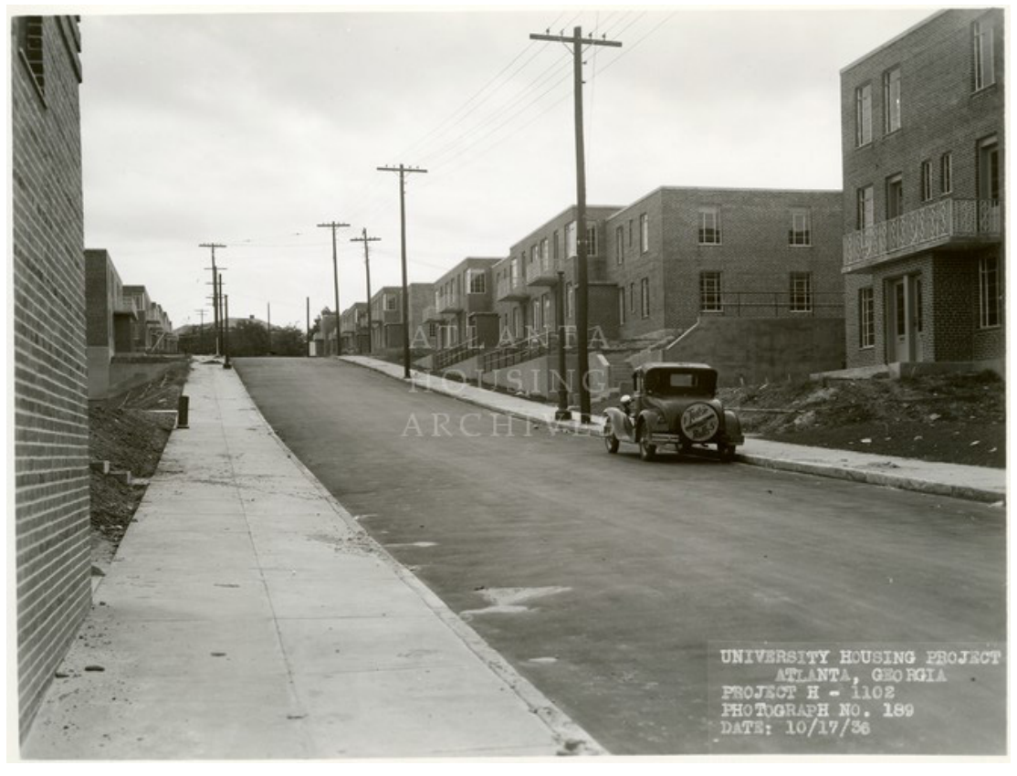
University Homes street view under construction, Atlanta, GA, 1936. University Homes Records, photograph UNIV2013_img_01666 (Atlanta, Georgia: Atlanta Housing Archives, The Housing Authority of the City of Atlanta).