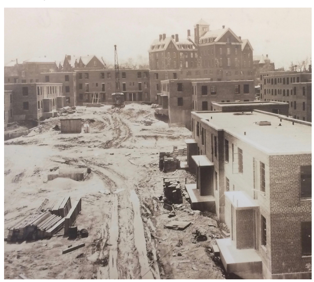
Construction of University Homes, with Spelman College in the background, Atlanta, GA, c. 1936.